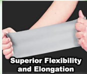
Superior Flexibility and Elongation