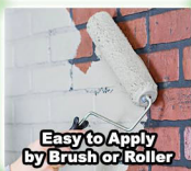
Easy to Apply by Brush or Roller