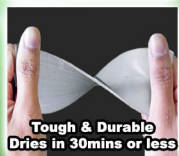
Tough & Durable Dries in 30mins or less